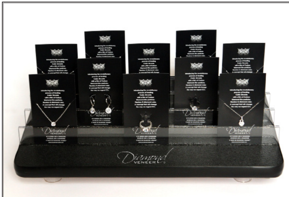
Diamond Veneer in-store Display (suggested product card arrangement) showcases up to 15 product cards. (16" wide x 12" deep x 5 3/4" high)

In purchasing the Diamond Veneer NO RISK program with a minimum opening order of $1,000.00 and $100.00 thereafter will receive a beautiful logoed, fine jewelry display stand along with a stunning, sparkling jeweled frame, and logoed gift boxes for the number of pieces of jewelry purchased. See the Diamond Veneer program set up items below.